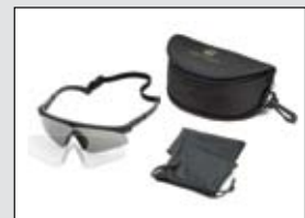
SAWFLY-TX Essential Kit