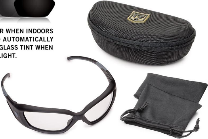
Revision Photochromic Hellfly Ballistic Sunglasses shown in their clear state.

LENSES ARE CLEAR WHEN INDOORS OR AT NIGHT AND AUTOMATICALLY DARKEN TO A SUNGLASS TINT WHEN EXPOSED TO SUNLIGHT.